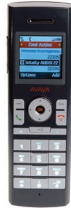
3631 Wireless IP Telephone

range of features and functions; it comes with an integrated button expansion module for quick access to features and people and super efficiency.