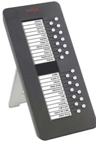
24 Button Expansion Module