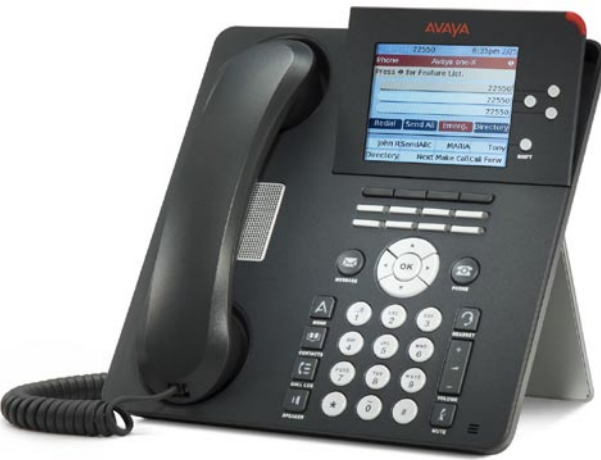
9650 IP Telephone